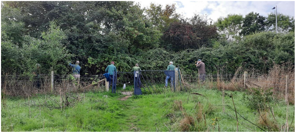
\textcircled{\sc c} Bracknell Conservation Volunteers 2022

The weather was partly sunny and warm (especially near the bonfire). There was some high cloud. We had a very good turnout of 23 volunteers.